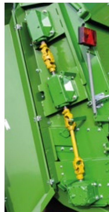
The optional cardanic drive of the TSW spreader unit minimizes maintenance and provides high power reserves.